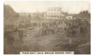
...Fair Day in 1913 Bruce Mines, Ontario

131 st Central Algoma Exhibition & Fall Fair